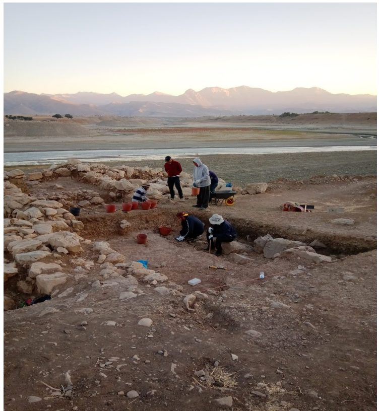
A picture taken at the site in Iraq, Usu Asker at dawn

I hope to visit School next academic year for an interactive workshop sharing with the children the different strands of my work, and how it can be used practically.